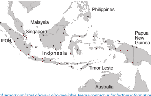
Note: Additional airport not listed above is also available. Please contact us for further information